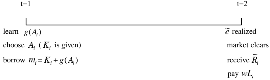
Figure 1: The Model Timeline